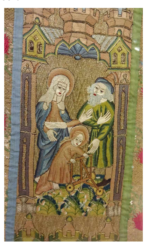
MARY IS PRESENTED AT THE TEMPLE:

MARY LEARNING TO WALK USING A FRAME (MOTHERCARE DIDN'T INVENT THE BABY WALKER!). YOUNGSTERS WERE ENCOURAGED TO WALK AS EARLY AS POSSIBLE AS IT DIFFERENTIATED HUMANS FROM THE BEASTS WHO WALK ON ALL FOURS: