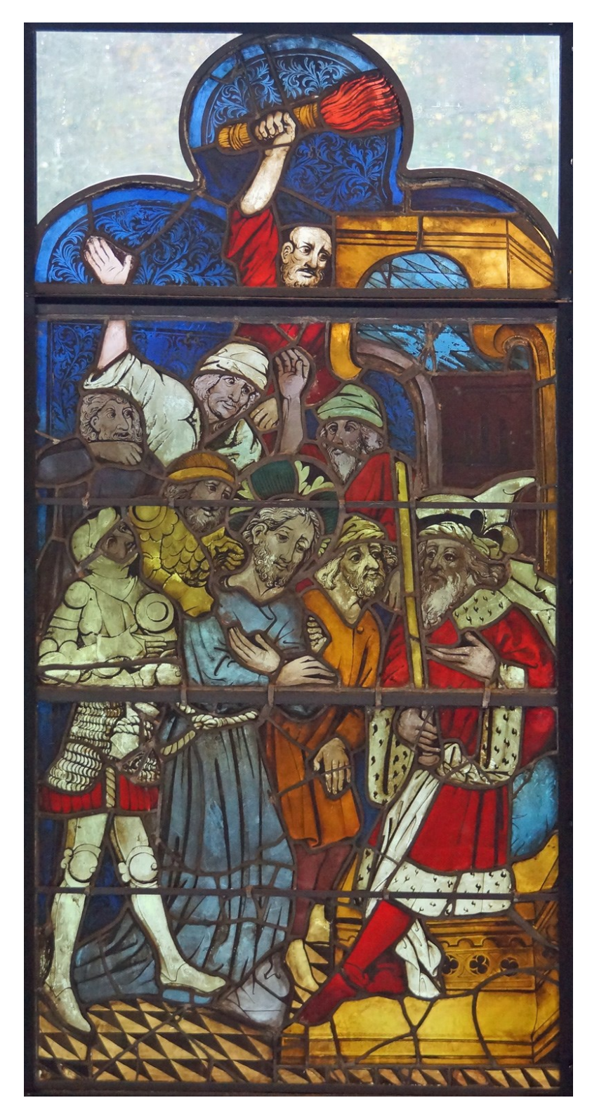
BOPPARD CHRIST BEFORE PILATE PANEL

beautifully composed and the faces and painted with realistic expressions. The colours are fabulous!