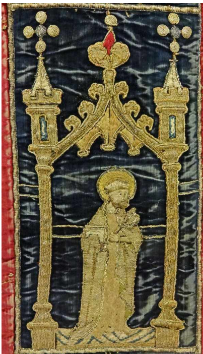
BURRELL COLLECTION—CHASUBLE FRONT AND BACK VIEWS AND DETAIL OF ST.PETER)