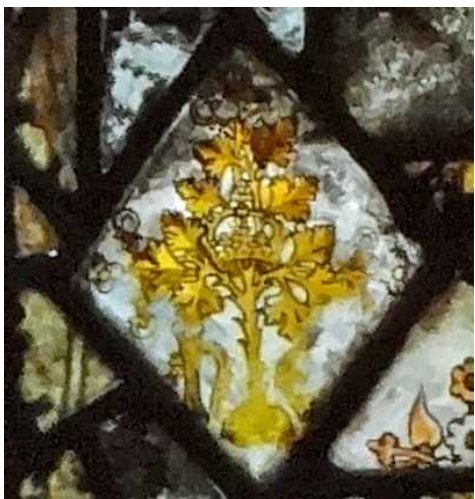
BURRELL COLLECTION ST PETER WINDOW AND DETAIL

Another panel, in the South-Corridor, shows the “St John the Evangelist and a Kneeling Soldier”. The panel depicts a soldier converting to Christianity during the Virgin Mary’s funeral procession. The soldier is in full armour holding a palm branch given to him by St John, who stands on the left dressed in a white mantle over a red tunic. St Peter stands with his key behind the coffin of the Virgin Mary, covered with a red drape and bearing the initial ‘M’. The initials IHS (Jesus) radiates in a roundel on the upper right. The panel is English from the Norwich School and dates to the 15th century. The panel probably comes from the Church of St Peter Mancroft, Norwich, built between 1430 and 1455.