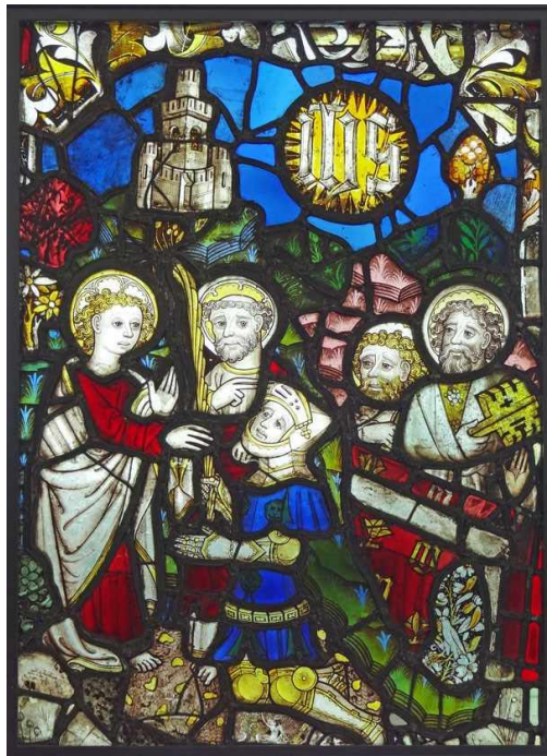
BURRELL COLLECTION ST JOHN THE EVANGELIST AND A KNEELING SOLDIER

There are several other representations of St Peter on display in the Burrell Collection. An English 15th century window in the Hutton Drawing Room shows St Peter with two keys., but less usually, a good crop of hair on top. A crown in a thornbush and the initials H and E for Henry VIII and Elizabeth of York is one of the badges at the bottom (the left-hand diamond shaped pane).