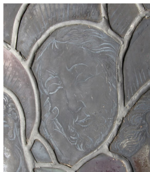
ORIGINAL PAINT RETOUCED