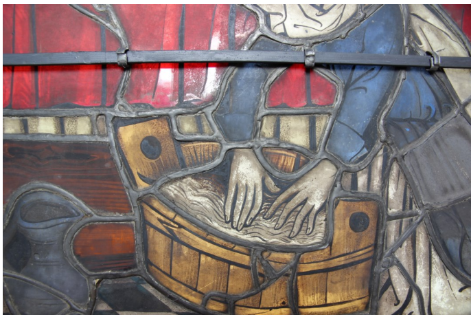
LEAD AND TINNING