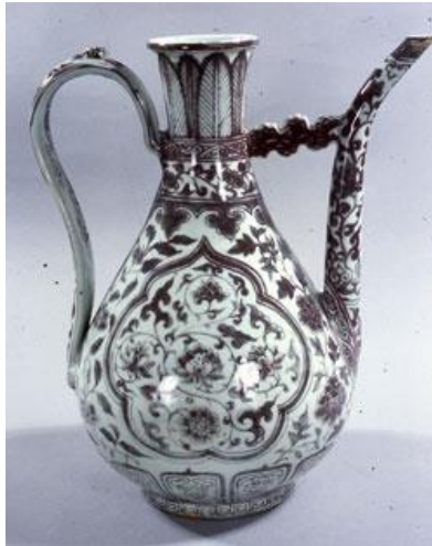
The Burrell Red Ming Ewer